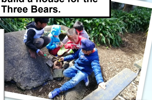
Room 18 gathered resources they could find in the garden to build a house for the Three Bears.