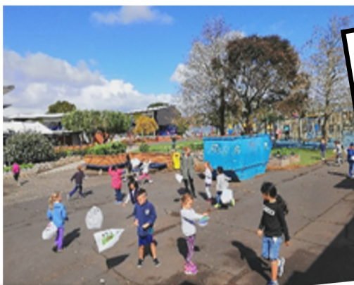
Room 21 had great fun making kites from paper, string & plastic bags.