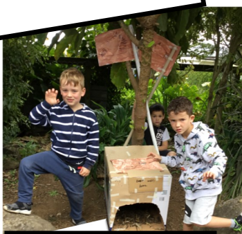
Thinking "outside the box" in Room 17!