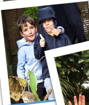
Room 16 really enjoyed getting outdoors and creating teddy bear houses in the garden.