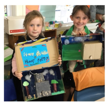
Room 19 created Fairy Tale dioramas and used Teddy Bears to problem solve.