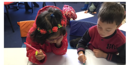
A Rich Maths Task in room 19.

We have already started learning about Diwali by making our own Rangoli patterns. We learnt that the patterns are passed down from generation to generation.