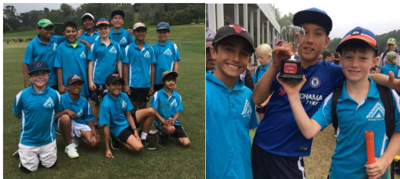
Boys B cricket team champions, B team with the cricket trophy