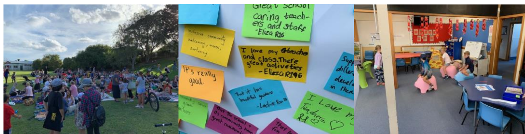
Our community at the Whānau picnic, Feedback from the picnic, Aroha's new pig friends