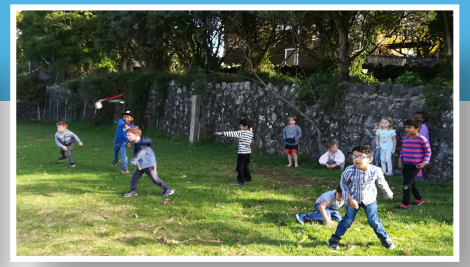
"We are champions at overarm throwing."