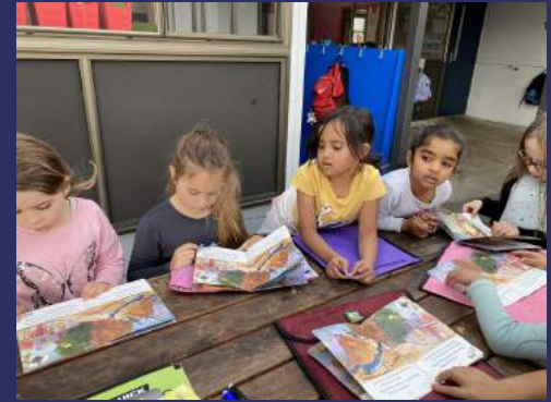
It is enjoyable to do our group reading outdoors at the picnic table from time to time.

We have learned that light is essential for shade. We also have noted that our shadow is much longer in the afternoon, much longer than our real length.