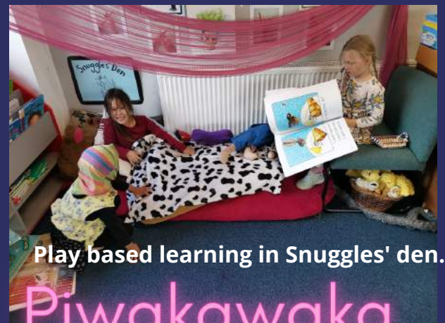
Play based learning in Snuggles' den.