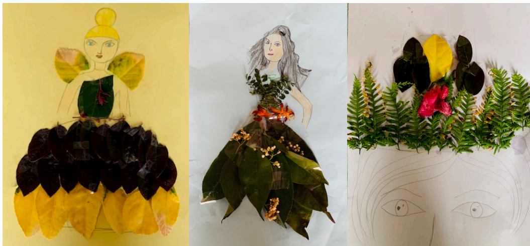
Sampriti room 10 has been making art with leaves from the garden